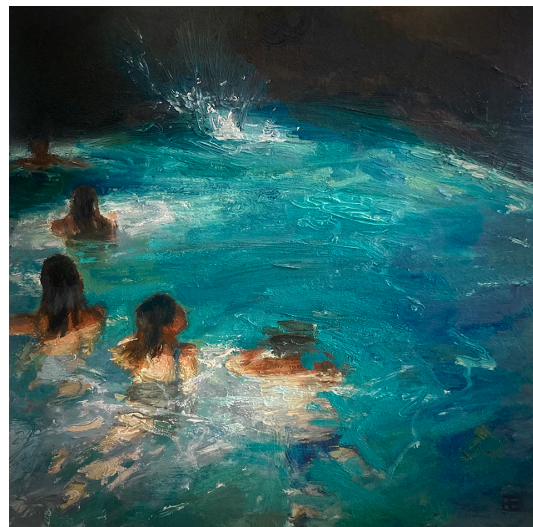
Anomalies, Oil 8"x8"

If you can't make the live monthly meetings on Zoom, most meetings are recorded and posted to our YouTube channel . The link is https://youtu.be/UKMwBRS8Paw .