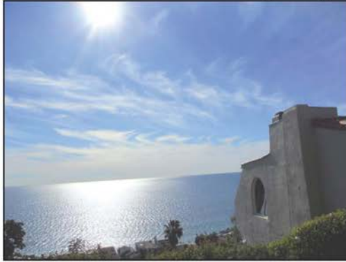
Winter skies over the Pacific are the most beautiful. This photo was taken from a street in Malibu.