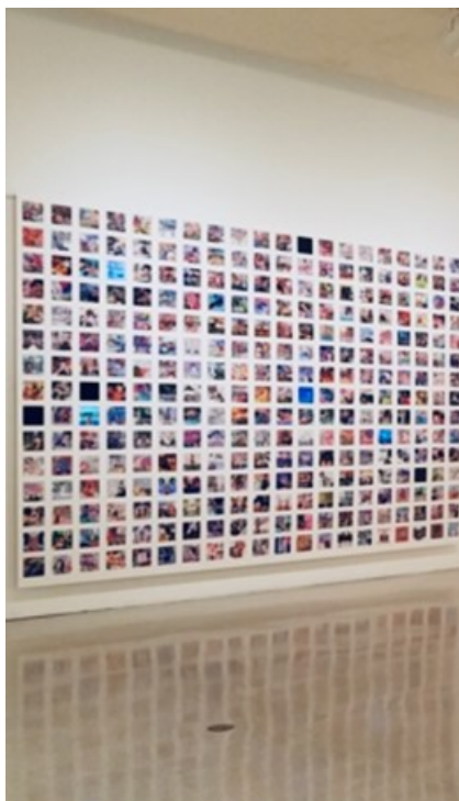
The wall of portraits will look like a "mosaic" when the Brand mounts the 8"x8"x1.5" canvasses.

DISPLAY AT THIS SHOW. PLEASE SEE THIS PHOTO OF A PREVIOUS EXHIBIT SHOWING WHAT AN EXCITING INSTALLATION