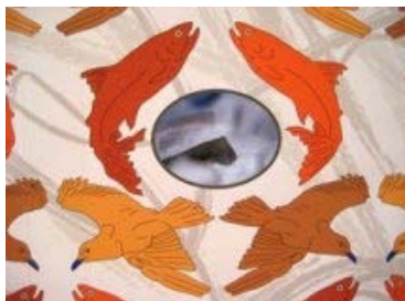
detail from a video of Niagara Falls viewed on monitors embedded within the installation's wallpaper.