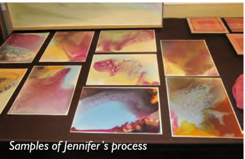
Samples of Jennifer's process